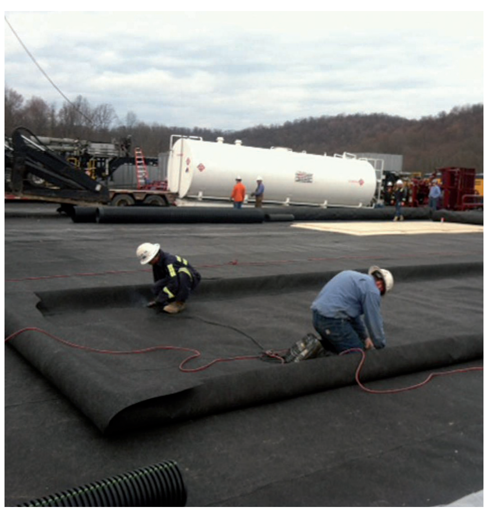
New Pig's unique materials make its pads stronger & longer lasting.